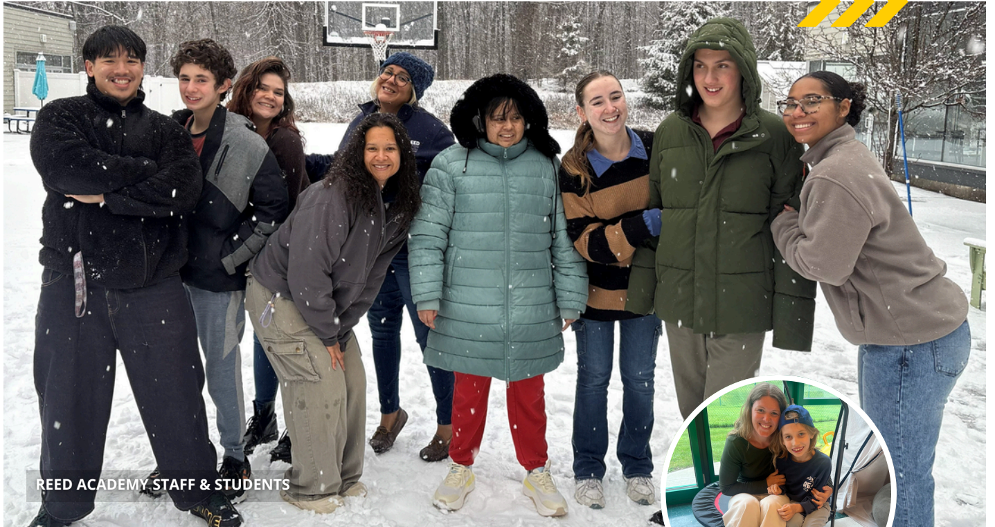
REED ACADEMY STAFF & STUDENTS